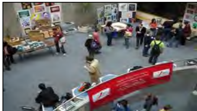
Participants mingle in the lobby of ASIJ prior to the Just-in-Time Technology TIOM.