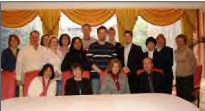
The 2007 Japan ASCD board debriefs with the 2008 Spring conference Presenters

Even as I write this article, I can easily remember when our next meeting is and what we will be doing and deciding. But, I have to scratch my head and think a little to recall these things about the previous meetings. That is the way it should be! I have trouble recalling the last Japan ASCD board meeting because we met and smoothly conducted the business at hand in an orderly and efficient manner. Unlike those old university department meetings, at Japan ASCD meetings there is no yelling, no strife, and nobody with knots in their stomach. I can easily recall, however, the next Japan ASCD board meeting and its order of business. Why? Because I'm looking forward to it not dreading it; and its purpose is so easy to support and enjoy. As a returning board member of Japan ASCD, I can attest to how enjoyable it is to be productive when the easiest meeting to remember is the next one!